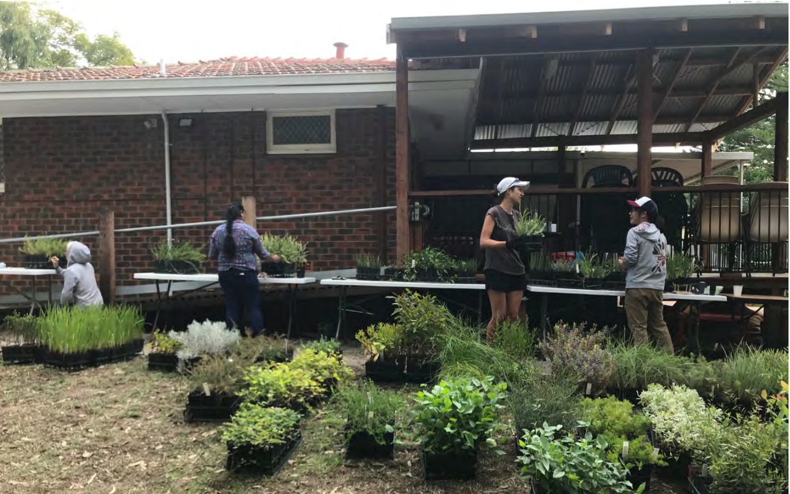
Photo: Volunteers packing plant packs for the City of Bayswater Plants to Residents Program.