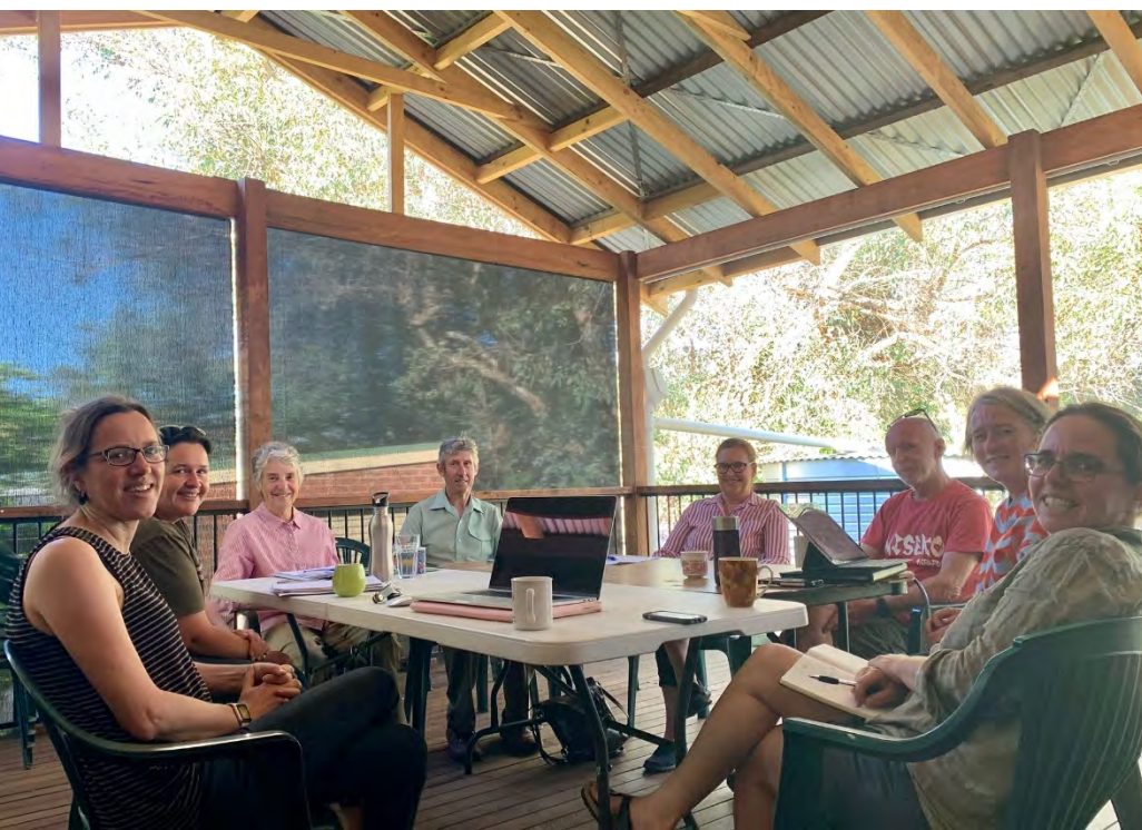
Environment House Management Committee

The core operational costs for Environment House in 2019/20 were $70,000 and were contributed from three key sources: City of Bayswater; Bendigo Bank Bayswater and Noranda Community Bank branches; and the customers of our EcoShop. With these funds we have been able to operate our EcoShop as an education centre and support forty volunteers on the ground delivering projects in our community – it is difficult to calculate the in-kind contribution of these activities given the breadth of skills and amount of time given freely by so many people, but we estimate the figure to be between $300,000 - $400,000 a year. Our projects in 2019/20 are outlined in Diagram 1 (page 12).